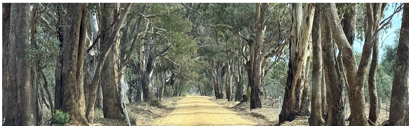
Grey Box along Lewis Road Bronwyn Silver