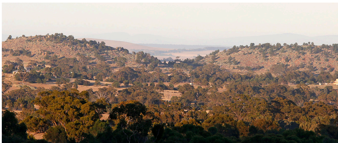
Looking west, Mount Back Road Bronwyn Silver