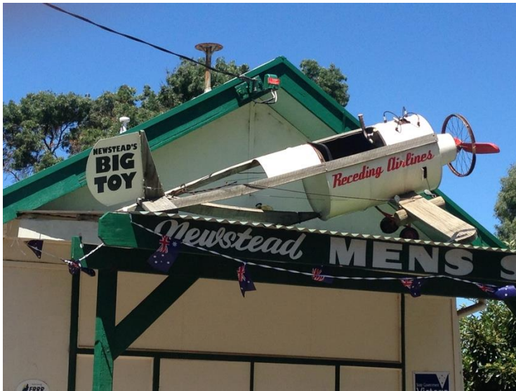
One of the interesting sights in Newstead